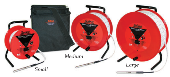
Model 101 Water Level Meter Reels

* PVDF laser marked tapes are only available in these lengths